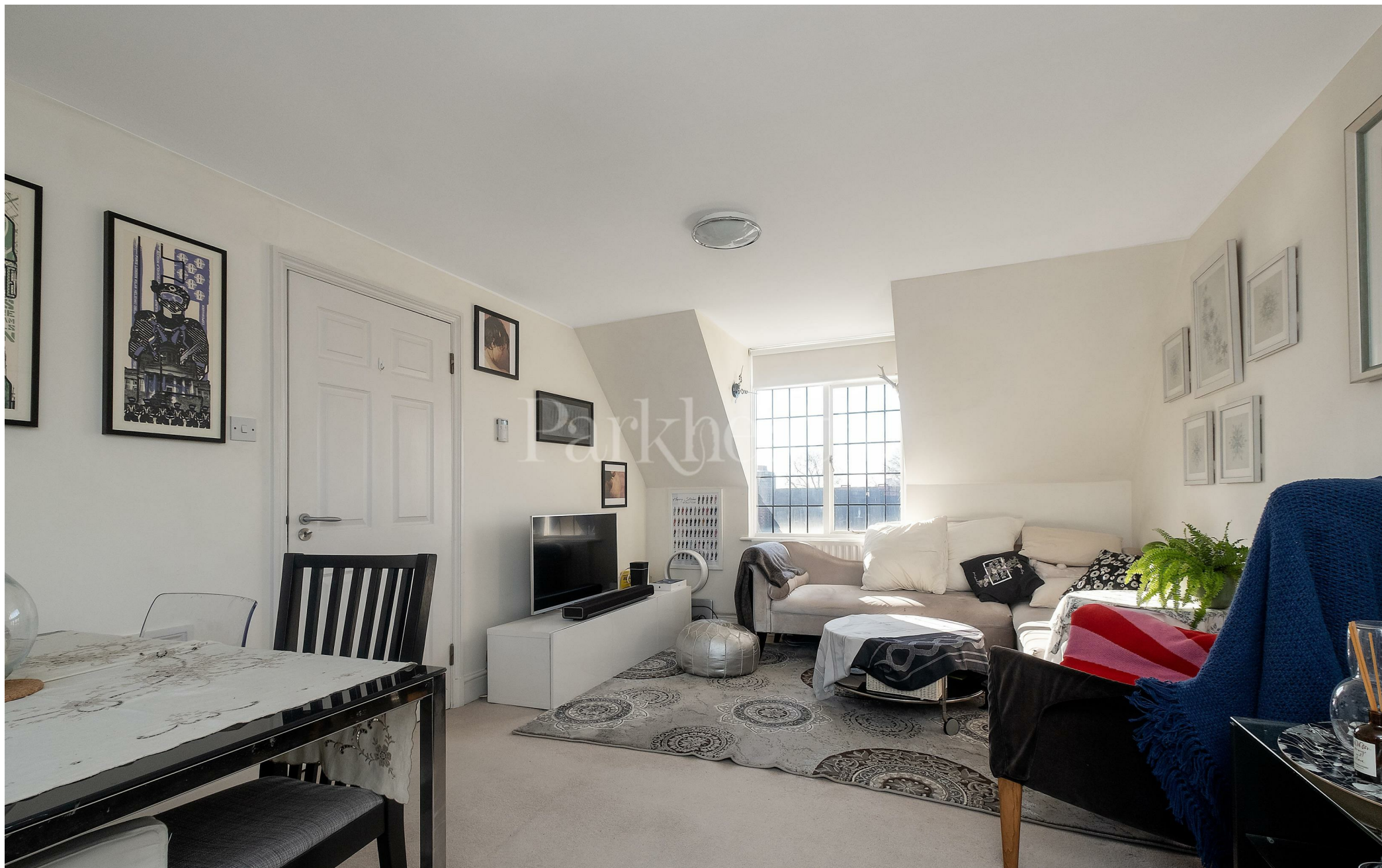
Tudor Close NW3